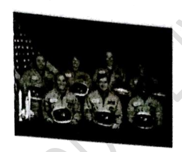
Fig. 8.3. The seven crew members

On 28th January, 1986 NASA launched it's Challenger space shuttle STS-51-L from Kennedy Space Center, Florida carrying seven astronauts including schoolteacher Christa McAuliffe - the first civilian to set out on a space mission. Florida had been experiencing particularly cold weather, and during the night before the temperatures had dipped as low as -13° C. The Challenger spacecraft consisted of a liquid-hydrogen powered orbiter designed to come back to earth, two solid-fuel booster rockets to help take the space shuttle into orbit and a fuel tank that could be discarded once empty.