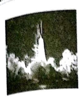
Fig. 8.1. The Challenger STS-51-L spacecraft at the moment of liftoff.